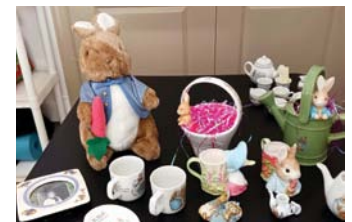
Some of the donated Beatrix Potter collectibles.