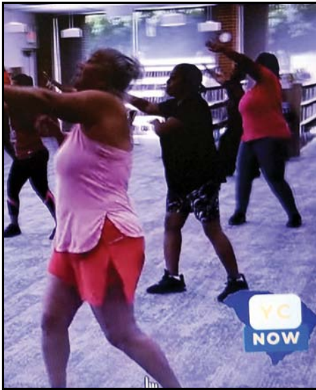
A Zumba class at the Rock Hill Library.